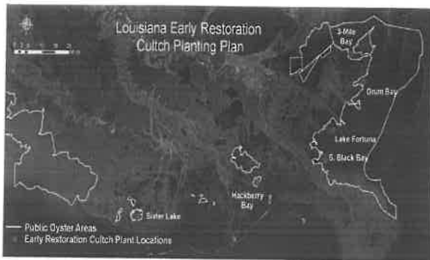
Figure 1. Louisiana oyster cultch planting locations.

A. County and State: Coastal Parishes of Louisiana