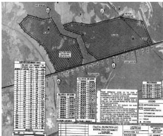
Lake Hermitage Marsh Creation – NRDA Early Restoration Increment.